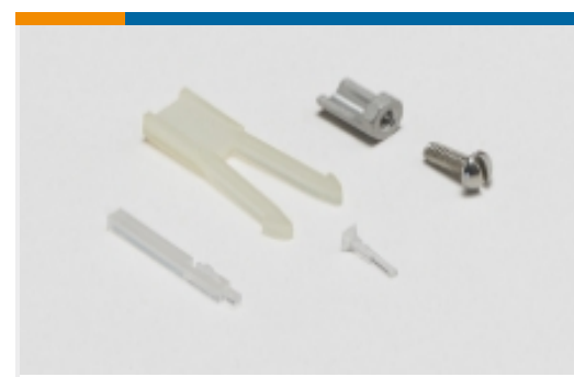
PCB Connector Keying(2)